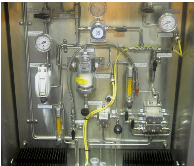
Figures 5 & 6: FS10A in remote configuration; hot process sampling system (VAM/new shelter)

Sam Kresch, Fluid Components International (FCI)