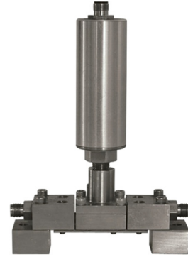
Figure 2: FS10A mounted in SP76 manifold