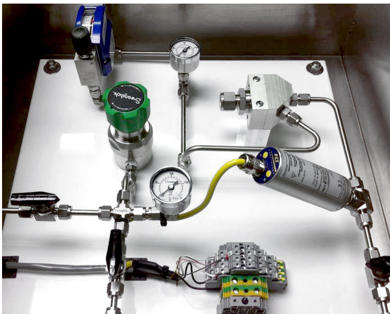
Figure 1: Typical sampling system

While there are a number of fluid flow monitoring technologies on the market, immersible thermal dispersion technology combined with packaging and sensor designs optimized for sampling systems has emerged as the new best-in-class technology. Thermal dispersion mass flow sensors have proven themselves for decades as extremely reliable in other demanding process and plant applications—often in relatively close proximity to analyzer systems.