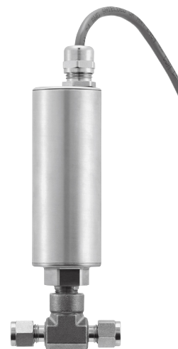
Figure 4: FS10A in tube tee

There are two major types of thermal devices on the market. One type utilizes a capillary bypass technique and is better known as a Mass Flow Controller or MFC. MFC's divert a portion of the main flow into a small bypass and sense the heat transfer of flowing fluid in the bypass channel. This technique can be very effective; however, the capillary tube is highly susceptible to contamination and clogging and should only be considered for use with clean or pre-filtered fluids. Capillary bypass flow