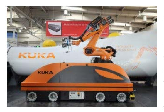
Kuka Mobile Platform "moiros" Using Autonomous Navigation

"moiros." Kuka presented the "moiros" as a concept vehicle targeted for aerospace and wind power production environments. Kuka's vision of mobile technology is more applicable to agile and flexible manufacturing environments. With a robotic arm mounted on the mobile platform, the work piece can remain stationary while the robotic arm is relocated using an autonomous vehicle. The concept presents a new way to envision discrete manufacturing processes, as production lines for large structures may now involve transporting the robot to the work in process.