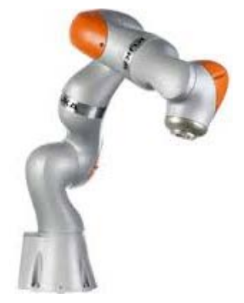
Kuka's "LBR iiwa" Lightweight Robot with Integrated Forces Sensor in Each Joint

The market for cage-less robots has been developing over the last year as startups such as Rethink Robots and Universal Robots have created a new category in the burgeoning robotic market. In addition to being able to be deployed without a cage, these systems can be "taught" without programming, even by workers with low skill levels.